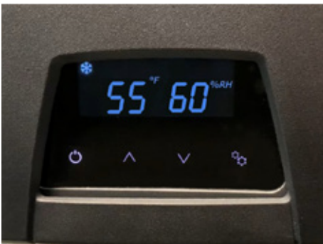
Front Digital Display